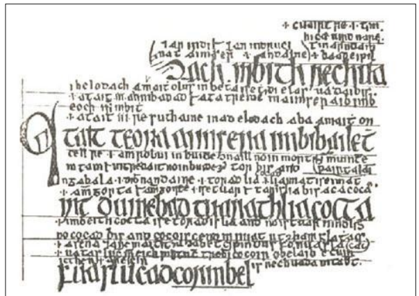
Figure 5. Senchus Mór fragment. The primary text is in larger script; the commentary text, in the smaller

The Senchus Mór is a collection of legal decisions by the Celtic judges, together with detailed commentaries on the individual decisions. Both the Celtic judges and the Celtic poets had their roots in the ancient druid religion before Christianity. The Druids or druí were as highly ranked in their time as Nuallán the fili was in the 10 th century. They performed several functions: They conducted all the sacred religious rites. They were seers, healers, poets, and judges. By the Christian era, however, the various druidic functions had become separate professions. 36