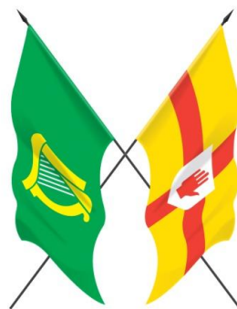
Figure 1. The Harp and the Hand

The sectarian troubles between the Republic and Northern Ireland make it easy to focus on the two countries' differences. While this book explains how and why the conflict began, it focuses more on what the two states have in common—after all, they were one state until the 1920s. Until the seventeenth century, they lived through the same history. They celebrate many of the same holidays, and they share many of the same myths and superstitions. They claim common ancestry from Celtic tribes and Vikings. But most of all, they share the same sad history of forced exile from the green and lovely land of their ancestors.