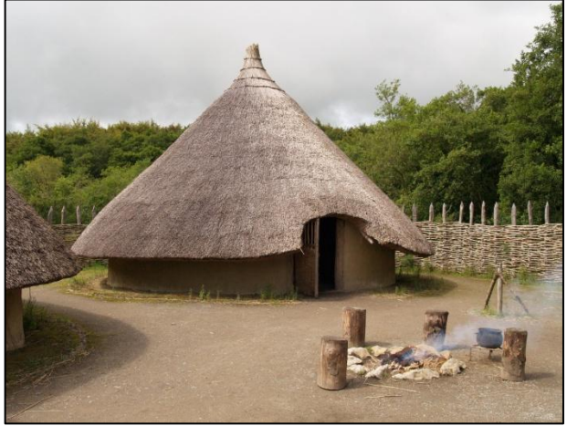
Figure 3. Reconstructed ringfort house

lined the interior walls in order to leave room both for entertaining and for daily activities, including cooking, bathing, and clothes washing. Cooking was done outside or over an open hearth; there was no chimney, only a soot-blackened opening in the roof for smoke to escape. 22 All ringforts in the tuath were circular and surrounded by water-filled ditches. The inner bank of the ditch was protected by a tall earthen embankment. The embankments of some of his retainers were topped with a wooden fence of post and wattle (woven wicker branches); however, Airmire's own bank was crowned with an ancient, impenetrable hedge of blackthorn. The ringforts of Airmire's retainers had one surrounding ditch and embankment, but Airmire's had two. Most ringforts had just one gate and an earthen bridge into the interior; they were generally located on the east side of the homestead. The purpose of these defensive constructions was as much to prevent the loss of livestock as to deter attacks from enemies of the tuath 23