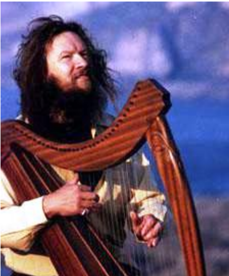
Figure 2: A Celtic fili

The year was 936, and Ireland had been Christian for 500 years. No longer just a Celtic celebration, Samhain had long since been adopted by the Church as a Christian festival as part of its effort to channel pagan practices and enfold the Celts into Christianity. November 1 became All Saints' Day, when a special mass was said for the souls of the departed. The night before, All Hallows Eve, would come to be known as Hallowe'en.