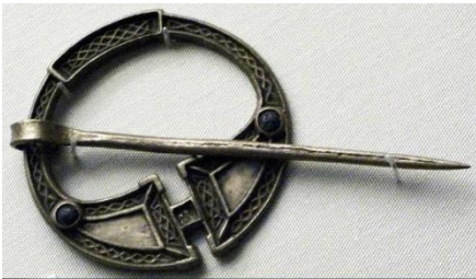
Figure 4. Medieval Celtic shoulder brooch, British Museum (courtesy of John Byrne)

The two men took their places in the most important position in the banqueting circle. They sat on mats of dried grass behind a low wooden table, and they shared a silver cup of wine with nearby nobles. The lower-ranked men, seated near the door, shared wooden containers of wheaten beer.