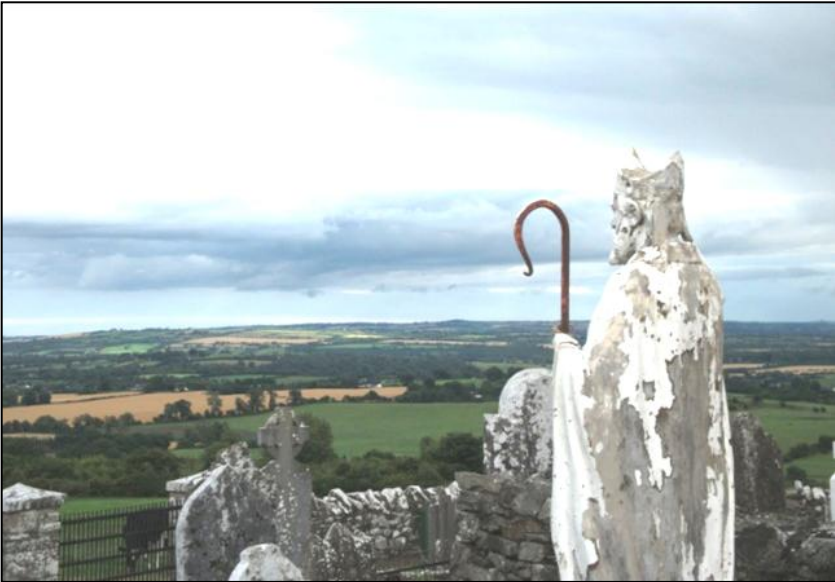
Figure 8. St. Patrick's statue on Slane Hill overlooks the Boyne River Valley.

M any years later, when Fergus mac Ainmire was a married father with a ringfort of his own and also cousin to the new rí túaithe , Nuallán the fili died far away, on the other side of the Kingdom of Brega. He was an old man who no longer could travel, so it had been many years since he had visited the Uí Uidhir. But he had not forgotten the eager boy with bright blue eyes who sat at his feet and begged for story after story. So before he died, he sent his last pupil to find Fergus. Since Nuallán had never married or had children, and he wanted to bequeath his most prized possession to Fergus, who he knew would treasure it. And so he did. Until the day Fergus died, the harp of Nuallán hung in the place of honor in Fergus' ringfort. The harp would be passed down from father to son for generations, long after they had forgotten about the man who had sounded like a god when he played it.